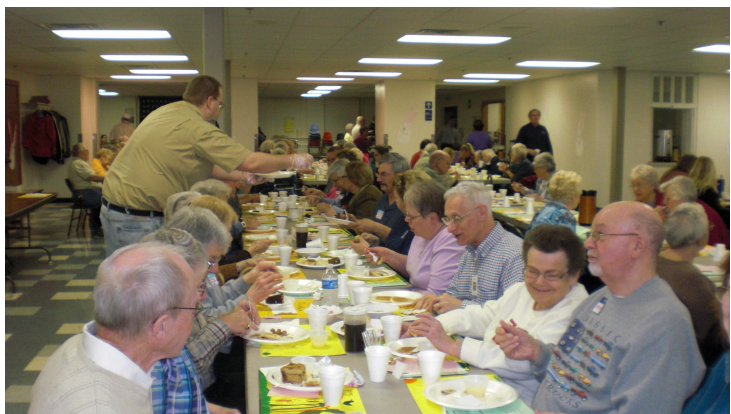
Scout Troup 126 helps serve the meal to a crowd hungry for pancakes and a stimulating program